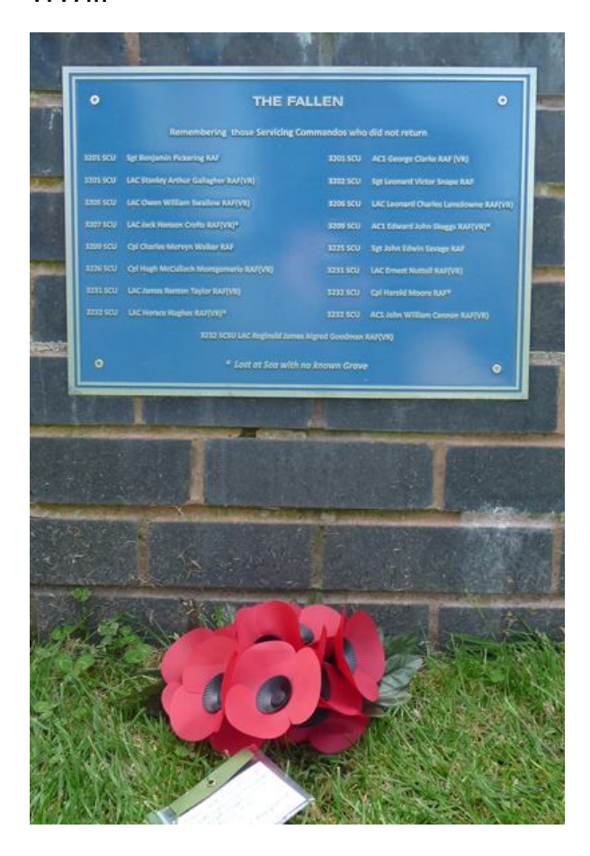
The plaque in position on the Servicing Commando plinth at the NMA

60 members. As usual, the weekend started with a 'meet and greet' at the Tillington Hall Hotel on the Friday evening. The AGM was held on the Saturday morning, which preceded the TSW Families Day at Beacon Barracks, while some 20 members visited the National Memorial Arboretum (NMA) at Alrewas for the dedication of the plaque to the Fallen Servicing Commandos of WWII.